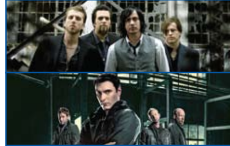
Three Days Grace (top) and Breaking Benjamin (bottom).

Three Days Grace's recent release, LIFE STARTS NOW, debuted at #3 on the Billboard Top 200 charts. Breaking Benjamin's recent release, DEAR AGONY, opened at #4 on Billboard's Top 200.